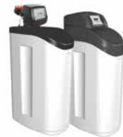
CS1 1035 / CS1H 1035