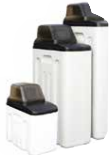
CS3L 1017 / 1035 / 1044+ Cover