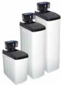
CS4L 0817 / 0835 / 0844