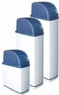
CS4H 0817 / 0835 / 0844