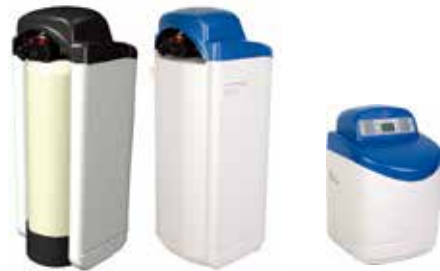
CS5H 1035 / CS5H-MO 1035 / CS5H-MO 1017