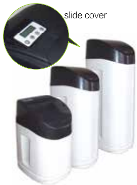
CS6H 1017 / 1026 / 1035 (Slide cover)