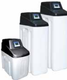
CS3H 1017 / 1035 / 1044