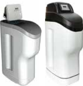
CS2L 1035 / CS2 H 1035