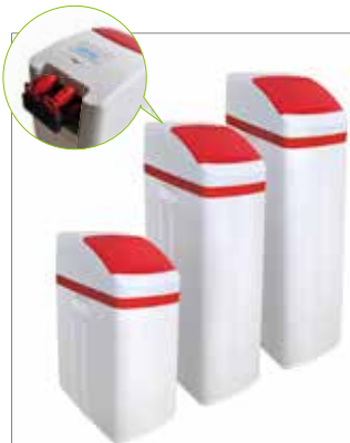
CS4H 0817 / 0835 / 0844 (slide cover)