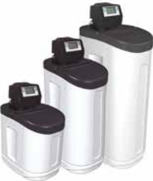
CS6L 1017 / 1026 / 1035