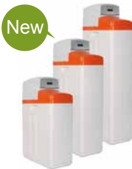
CS4H- II 0817 / 0835 / 0844